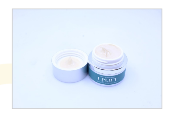
Unit: 0.5oz | Units Per Package:1

Analyzed via AAM-001 using Agilent 1220 HPLC-DAD. Limits are based on CO 6 CCR 1010-21. Sample was analyzed as received. Deviations from SOP: None.